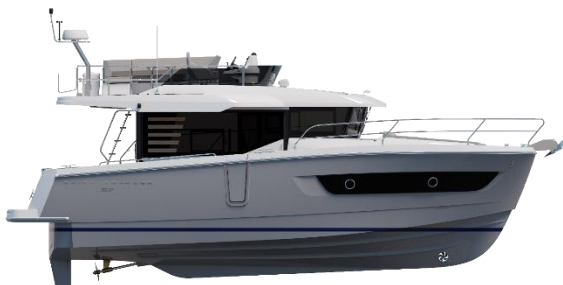
Hull Signal Grey - Flybridge