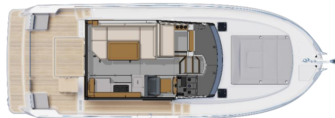
Main deck - Standard