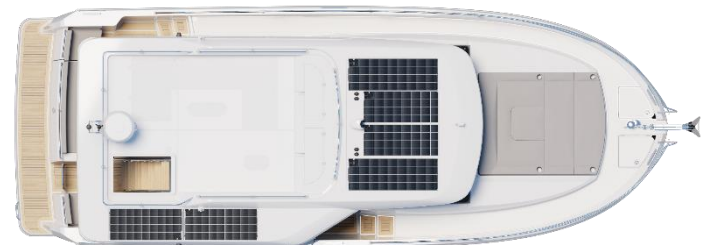
Sedan - Silent boat option